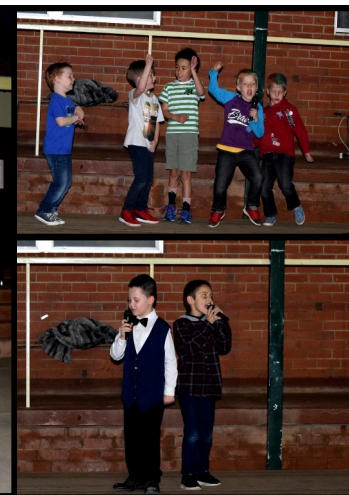
Lip Sync Battle Grand Final