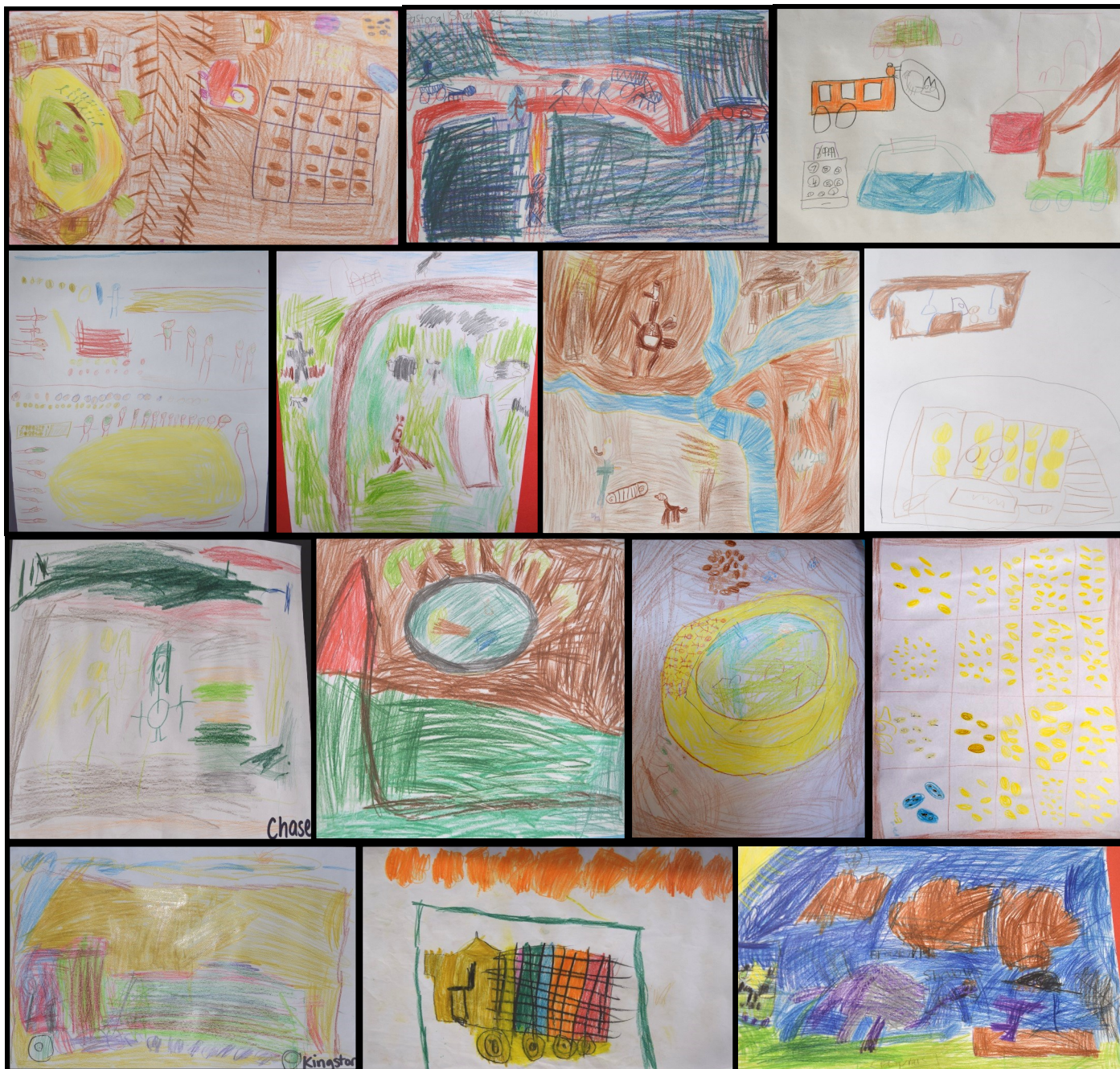
'Year 1 & 2 History Excursion Depictions'