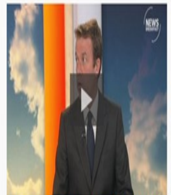
VIDEO: Assistant Minister for cyber-security Dan Tehan says up to three Australian businesses may have been affected

"We have to understand that ransomware costs the Australian economy $1 billion a year conservatively."