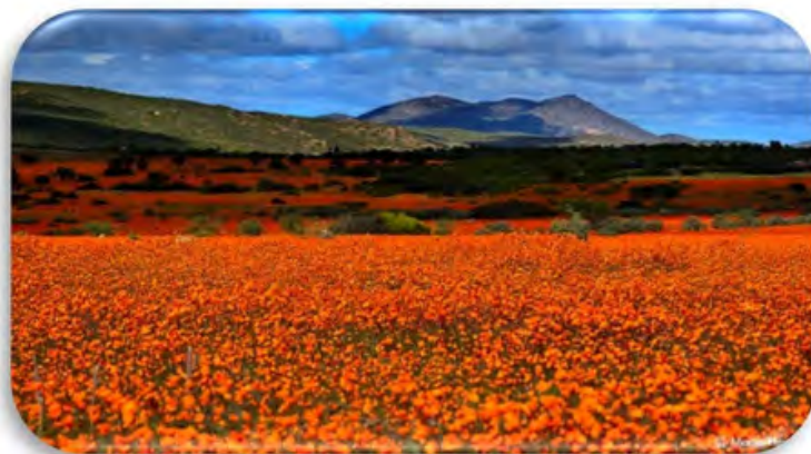
A field in the Republic of South Korea